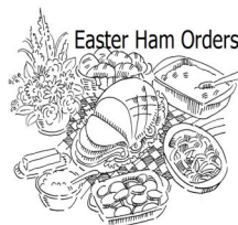
Easter Ham Orders