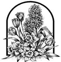
Order Your Easter Flowers