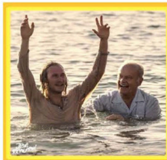
Jesus Revolution Movie Pic