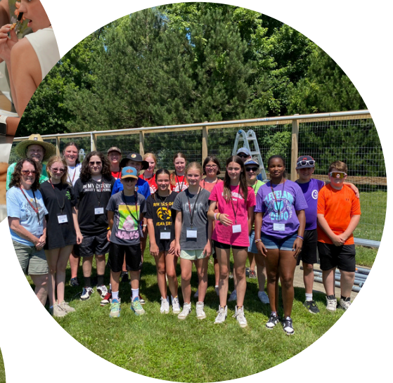
Middle School Mission Week

Join us for an exciting outing on August 18th to the Lake County Captains' Faith Day at 1 PM. Please be sure to sign up as soon as you can using this link . Meal included with ticket.